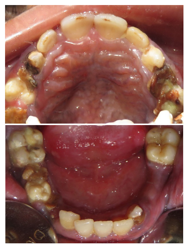
Figures 5 and 6 - Maxillary and mandibular arch showing multiple non-restorable deciduous teeth