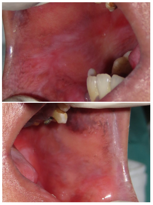
Figures 2 and 3 - Right and left buccal mucosa showing whitish lichen planus like lesion

The patient had an extra oral swelling on the right side of face, he also had severe oral stomatitis with erythema and ulceration of oral mucosa which was causing lot of discomfort and difficulty in mouth opening. Before performing detailed oral examination, patient was advised oral rinse with 2% lignocaine solution to achieve adequate topical anaesthesia of oral mucosa enabling comfortable oral examination. In routine procedures, topical anaesthetic gels and mouthwashes are recommended. But, in this case, patient complained of pain on application of the gel whereas gargle with anaesthetic mouthwash caused burning sensation (probably due to the flavouring agent). Thus, plain 2% lignocaine solution was used which, though bitter, was tolerated well by the patient. Examination of the oral tissues was done using mouth mirror coated with lignocaine jelly to avoid any injury to the fragile oral tissues. On oral examination whitish leukoplakia like lesions were present bilaterally on the buccal mucosa (figures 2 and 3). The tongue was smooth and erythematous with atrophy of the papillae (figure 4).