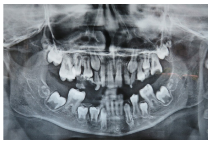
Figure 7 - Pre-operative Orthopantogram (panoramic radiograph)

The patient's parents were explained about the treatment procedure and risks and an informed consent was obtained. Extraction of primary maxillary right canine, primary maxillary right first molar, primary maxillary right second molar, primary mandibular right canine, primary maxillary left canine, primary maxillary left first molar, primary maxillary left second molar and permanent maxillary left first molar and permanent mandibular left first molar was planned under local anesthesia. Due to debilitating condition of the patient, dental treatment was scheduled in two visits at the bed side itself. We decided to perform extractions on the right side first followed by the left side on a later appointment.