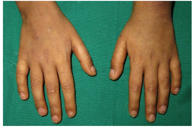
Figure 1 - Dystrophic nails and keratotic areas on fingers

side in the ward itself. On general examination, the child was malnourished, showed an evident pallor, hypopigmented areas on the skin, dystrophy of the nails (figure 1), hyperkeratotic areas on the fingers and photophobia. Patient's elder brother also had the same condition but of a milder phenotype and the mother was a carrier of a recessive gene.