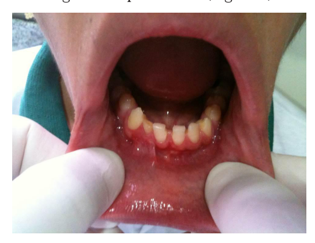
Figure 4 - Seventeen-days clinical follow-up

The patient was properly instructed to the postoperative care and medicated with corticosteroids, antibiotics, analgesic and anti-inflammatory. There were no significant postoperative complications, the suture removal was performed 7 days after surgery where it was possible to observe a good healing, no swelling and no paresthesia (Figure 3).