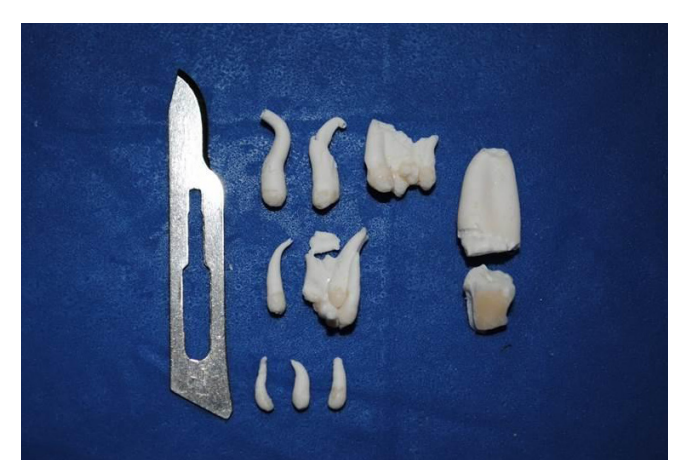
Figure 3 - Denticles removed

The patient was properly instructed to the postoperative care and medicated with corticosteroids, antibiotics, analgesic and anti-inflammatory. There were no significant postoperative complications, the suture removal was performed 7 days after surgery where it was possible to observe a good healing, no swelling and no paresthesia (Figure 3).