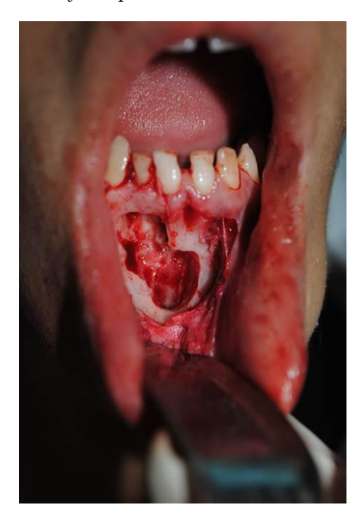
Figure 2 - Incision, mucoperiostal flap, osteotomy and bone cavity after removal of denticles

topical (Riodeine®) and intraoral performed with chlorhexidinegluconate 0.12%; regional anesthesia by blocking the bilateral mental nerve and complementation with infiltrative techniques. The Novak-Peter incision was made in the region of element 43 to 41. After detashment the mucoperiosteal flap, it was performed an osteotomy with surgical round burs in high rotation under irrigation with saline 0.9% for access to denticles and the element 42, which were removed with straight and curved extractors (Figures 2 and 3). The flap was repositioned, and the suture was performed by simple sutures isolated.