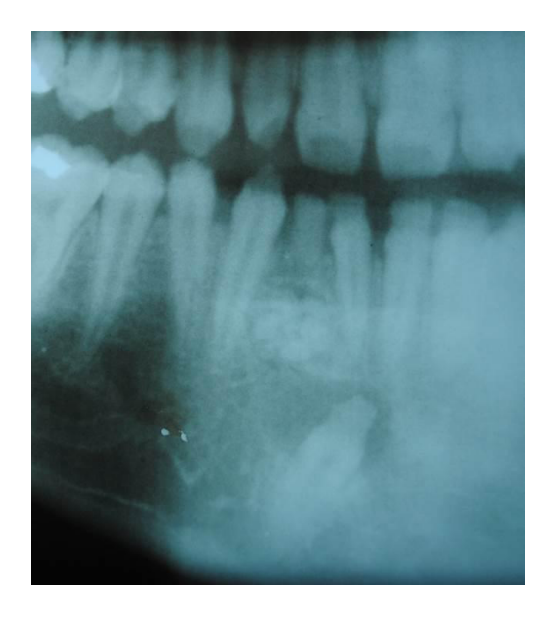
Figure 1 - Panoramic radiograph

Panoramic radiograph and clarck technique was requested for better visualization of the lesions and the location of the element 42 (Figure 1).